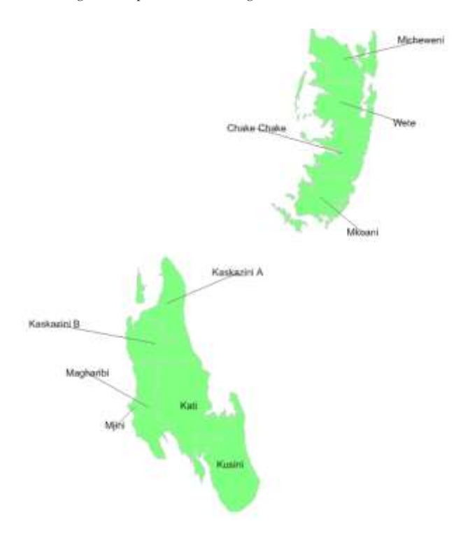
Figure 1.1: Map of Zanzibar showing District Boundaries